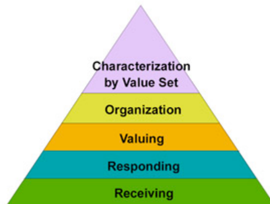
Figure 1. Krathwohl’s Affective Domain|

Because of its focus on how we develop values in our life, we became interested in Krathwohl’s Taxonomy of the Affective Domain (Figure 1.) as a way to assess student learning. Although we were aware of Shulman’s Table of Learning and other affective assessments, we specifically chose Krathwohl’s Affective Domain because it applied so well to our project and seemed to be underutilized in educational practice. Krathwohl’s categories detail how we adopt values about objects and concepts, classifying the cumulative adoption of a value in levels of learning.